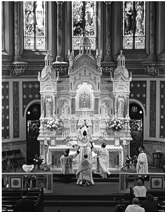
Elevation of the Chalice Solemn Mass of Corpus Christi, 19 June 2022 at St. Stanislaus Church, New Haven.

✦ A few of our loyal members have already renewed their membership voluntarily for calendar year 2022. We offer them our thanks and invite the rest of you to please consider enrolling for this calendar year today to do your part in furthering the work of the Society with your tax-deductible contribution. A membership form is printed on the back of this newsletter for you to mail in with your check; or you can enroll electronically on our website at: www.saint-gregory.org/membership . A roster of 2022 memberships to date is printed below along with a list of those who have contributed during the several seasons before. A final roster of 2022 members will be printed in the spring issue of this Newsletter.