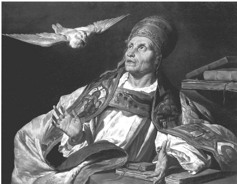
MATTHIAS STOM, Dutch, 17th c., "The Ecstasy of St. Gregory the Great"